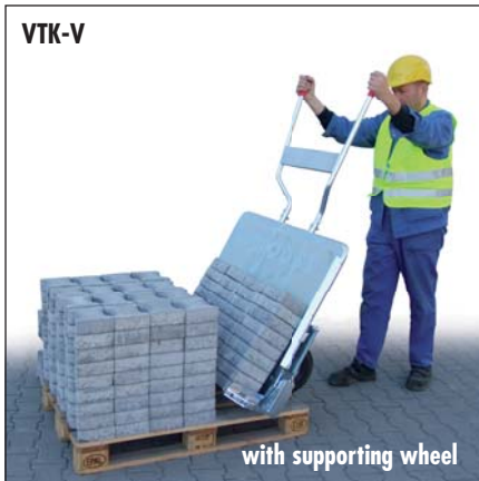
with supporting wheel