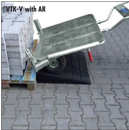
VTK-V with AR